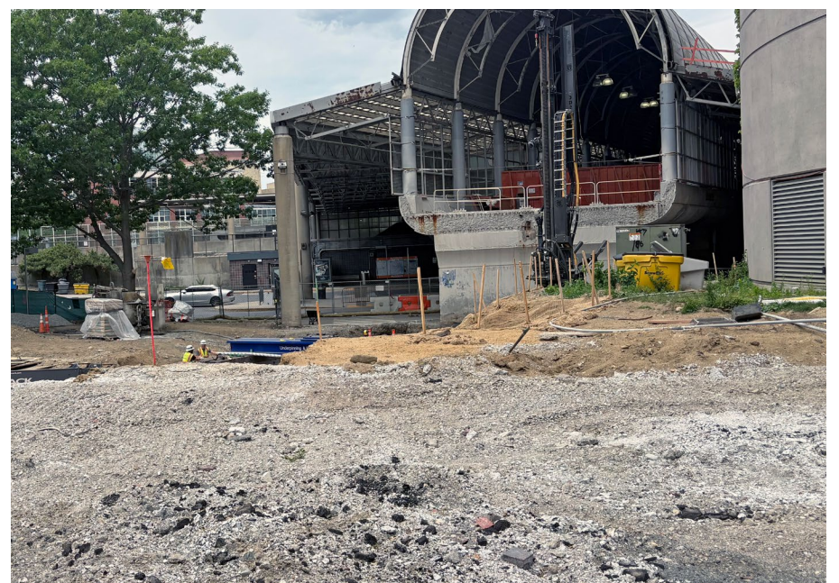
Two big construction projects have gotten fully under way; here's a peek at their progress. At left, with Matthews Arena now demolished, Northeastern has begun work on its 310,000-square-foot replacement. The site may look barren, but below-ground systems will play a central role in hitting aggressive sustainability goals. 46 geothermal borehole reaching up to 850 feet deep will tap constant ground temperatures to meet 80% of heating and cooling needs. A 100,000-gallon cistern will capture all rainwater that falls on the site to recycle for, among other things, ice in the hockey rink. According to Northeastern Global News, the project will be finished in fall 2028. At right, Phase II of Ruggles Station improvements will add new accessibility features (including a fully accessible entry and striking canopy on Columbus Avenue), sustainability improvements, better lighting and signage, and renovated, fully accessible restrooms. The MBTA projects that the $90 million project will wrap up in early 2028. Both photos were taken on June 22.