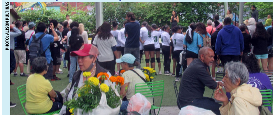
On Thursday, June 18, Mission Hill got a non-caffeinated coffee hour with Mayor Michelle Wu—it took place in the early evening, so apple juice and doughnuts filled in for the coffee. Heavy rain led to a shorter-than-expected program at the Tobin Community Center.