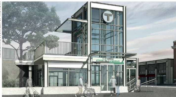
RENDERING COURTESY OF THE MBTA