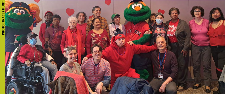
On Feb. 14, the Red Sox hosted a Valentine’s Day Dance for seniors at Fenway Park. Six senior groups were invited, including the Peterborough Senior Center, whose members danced up a storm.