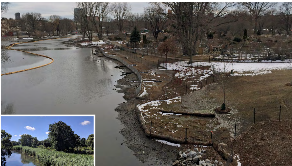
Views from the Boylston St. Bridge in Feb. 2023 (above) and Aug. 2018 (inset)—before phragmites removal.