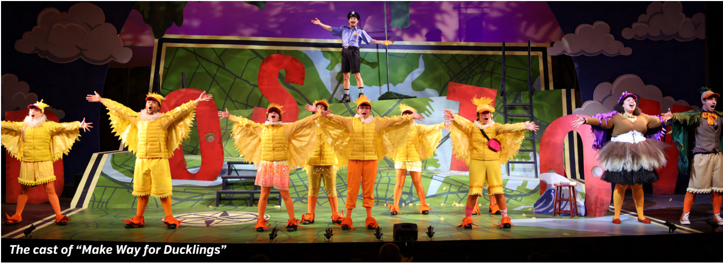
The cast of “Make Way for Ducklings”

A couple of years ago, my sister-in-law came to visit, and as we walked through the Public Garden, she saw the swan boats and exclaimed, “Oh, how stupid!” It shocked me to the core. We don’t say that, let alone think it, in Boston. I wished she’d stayed to see Wheelock Family Theatre’s Make Way for Ducklings and get an education in Boston culture. Or maybe not. Because McClosky’s book, first published in 1941, is full of old Boston with wonderful drawings, I assumed Wheelock’s