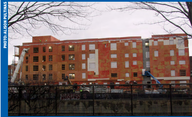
Construction on new Neighborhood Housing Services apartments near the Orange Line’s Roxbury Crossing station is set to wrap up this spring. The 46 income-restricted rentals sit on land cleared in the 1970s for a future extension of I-95.